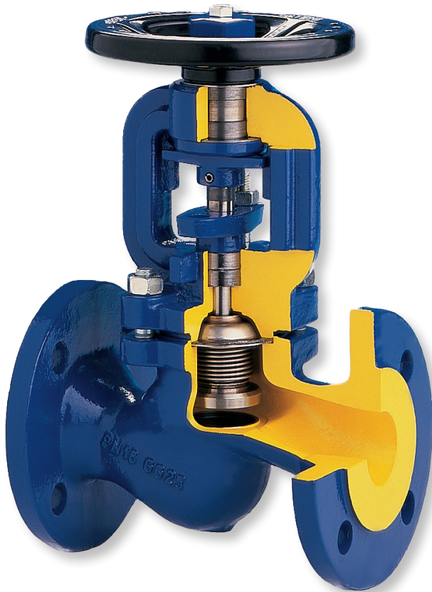
Graphite with packing nut