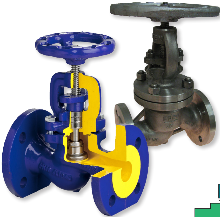
Graphite with packing gland